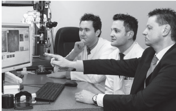
ZEISS Professional IT Services improve data and workflow processes from reception throughout the clinic at the LMU University Eye Hospital in Munich