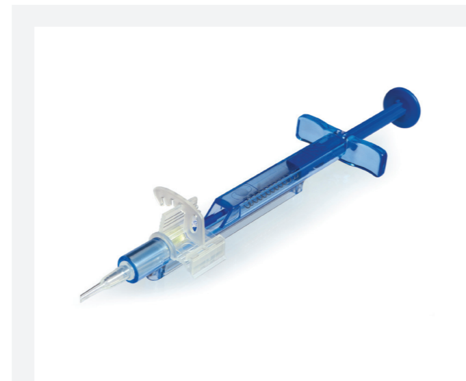
FIGURE 3. The BLUEJECT™ injector, compatible with the ZEISS CT LUCIA.

The CT LUCIA comes completely preloaded in ZEISS' latest injector, the BLUEJECT™ (Figure 3). Thanks to its advanced design and the lens being fully preloaded, lens preparation is fast and easy, while avoiding unwanted IOL manipulation. The injector is available in a variety of tip sizes and can be used with the entire diopter range of CT LUCIA IOLs. The BLUEJECT™ 2.0 mm tip injector can be used for the diopter range of 4.00 to 24.00 D, the BLUEJECT™ 2.2 tip injector for the diopter range of 24.50 to 30.00 D, and the BLUEJECT™ 2.4 tip injector for the diopter range of 30.50 to 34.00 D. The incision size is recommended to be 0.2 mm larger than the actual tip size. With a 2.0 mm injector tip and heparin coating on the IOL surface, ZEISS CT LUCIA can be implanted through small incisions with smooth unfolding into the capsular bag – without the haptics sticking to the optic. 3