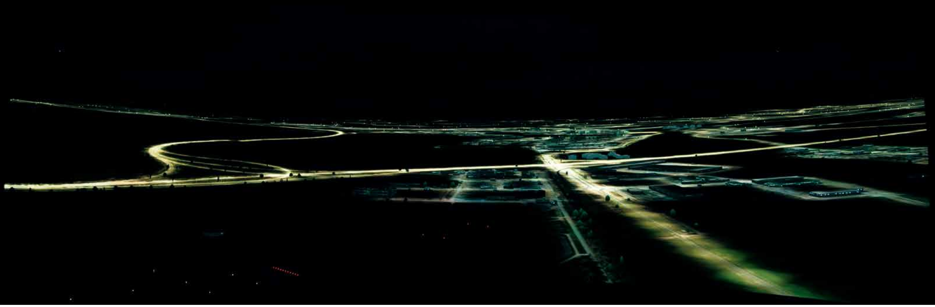
ZEISS VELVET SIM LED VISIR benefits